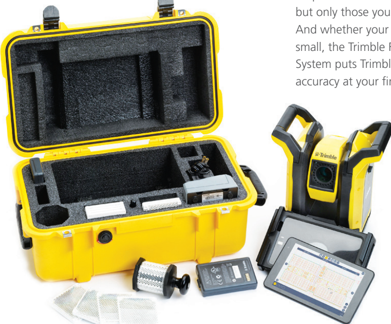
The Trimble RPT600 Layout Station is controlled by Trimble Field Link 2D software on a rugged tablet computer.

It's packed with innovative features, but only those you'll find invaluable. And whether your projects are big or small, the Trimble Rapid Positioning System puts Trimble quality and accuracy at your fingertips.